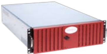
Switchvox SMB Redundant Rackmount System

Communication is the key to keeping your business running smoothly, and with a Switchvox™ system you can count on having the flexibility you need at a price you can afford. Switchvox is a complete business phone system in software. This means you can say goodbye to the monolithic PBX of the past. Now you can have the freedom to grow from a single office to a global network without breaking the bank. And because Switchvox systems are compatible with today's high speed data networks and traditional telephony infrastructure, you can change at your own pace.